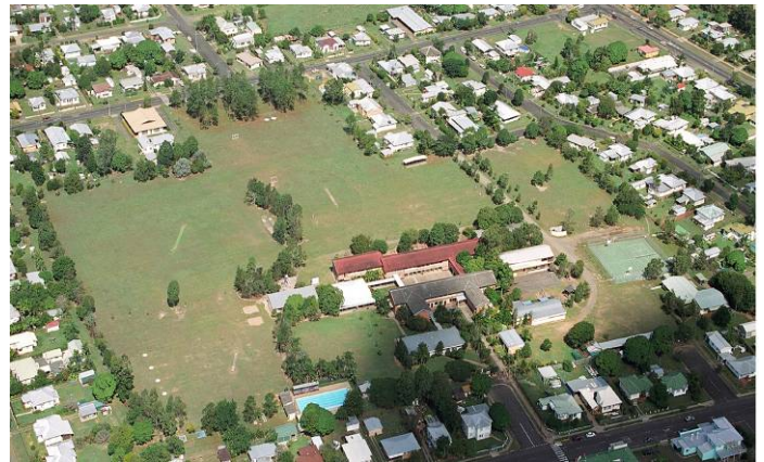
Aerial View of Walkervale School